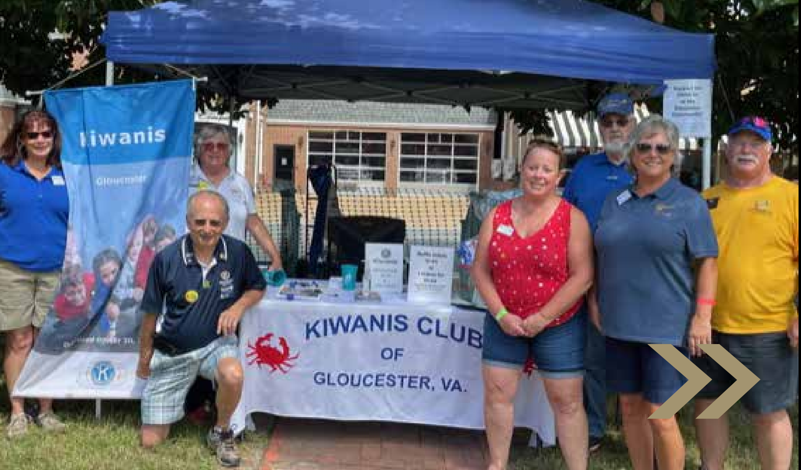
Kiwanians saw success at the Gloucester Membership Drive in September.