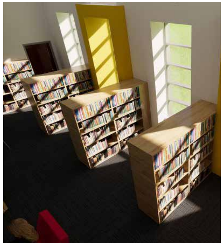
A look at the new bookshelves and reading nook area planned for the renovation of the James City County library children's area.