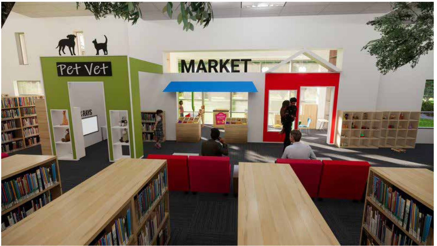
A conceptual rendering of the play village planned for the new Kiwanis Kids Ideas Studio