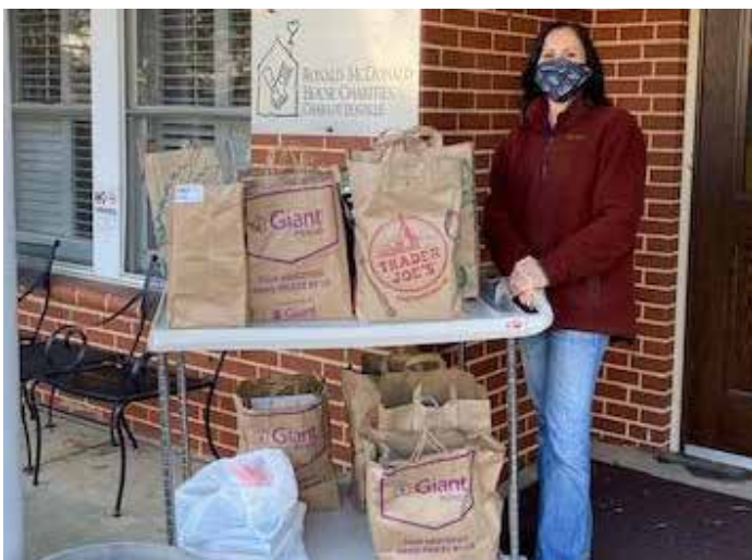
Kiwanis Club of Charlottesville

Members of the Kiwanis Club of Canton-Fells Point (featured on the cover) teamed up to put together bagged lunches for the Beans & Bread soup kitchen. Together, they assembled and donated 50 well-stocked bagged lunches! In addition, the club has continued with their monthly cleanups at Canton Waterfront Park.