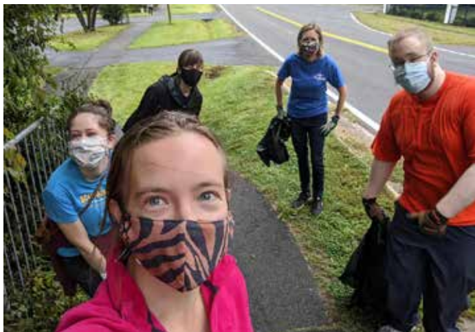
Kiwanis Club of Tysons