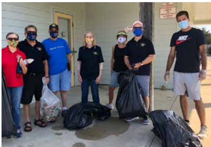
Kiwanis Club of Greater Ocean Pines-Ocean City

This month, the Kiwanis club will provide 150 local children with backpacks filled with 33 meals and healthy snacks for the 11-day Winter Break. That is a total of 4,950 meals. The club plans to replicate the project in April 2021 when it provides an additional 150 local children with backpacks filled with 15 meals and healthy snacks for the five-day Spring Break. That is a total of 2,250 additional meals.