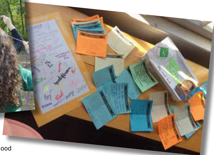
(From left) A team building activity during neighborhood time; the notes from Hira's mailbox.