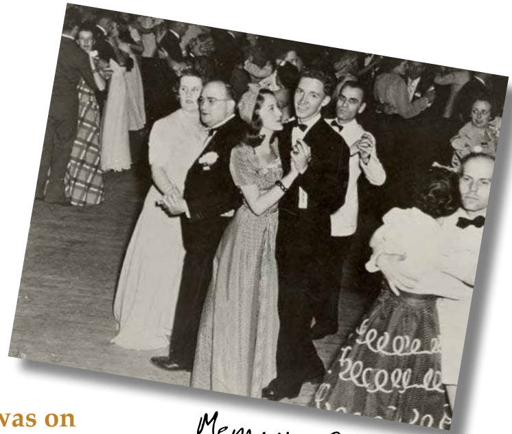
Memories from the 1940 Kiwanis International Convention!

A picture is truly worth a thousand words. I hope that your club will help us create this priceless memory of our Capital District Kiwanis Family.