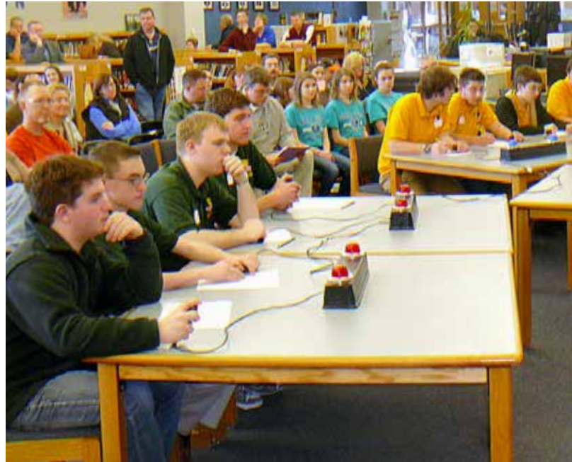
Contestants in the 2013 Spotlight on Youth Academic Challenge await the next question while spectators watch.

Service Project Tip #9: Ask your public school system what they need.